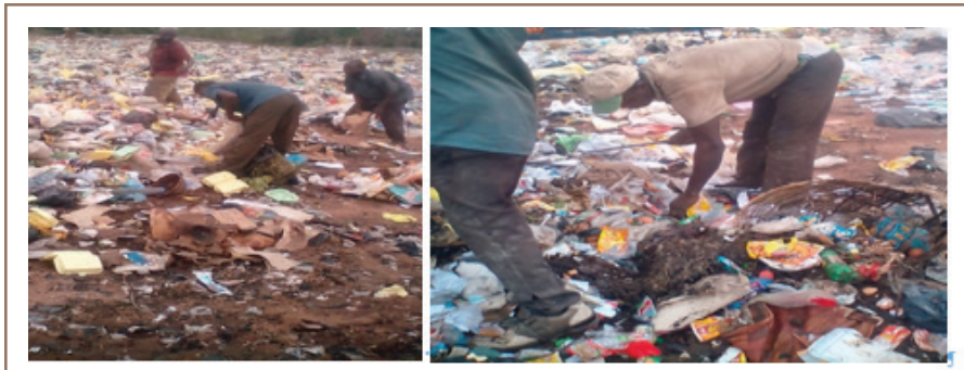
Figure 3 — Scavengers at work at Eyenkorin dumpsite in Asa Local Government area.

was low. There is a need for continuous and consistent training on waste handling and compliance with universal standard precautions, including use of PPE and vaccination. Studies have reported significant improvement ranging from 48% to 74% in compliance with standard precautions after an educational symposium and after a 30-minute educational program. 23,51-52 Greater availability of training and awareness programs could increase compliance with standard precautions for waste handling. 4,53